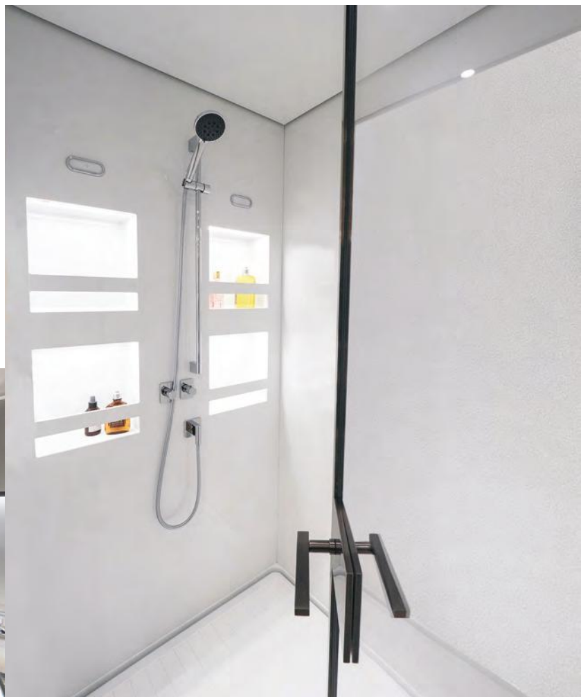
The master suite also has a washroom with an oversized shower and dual sink vanity

Kestrel Aviation Management's CEO Stephen Vella outlines the vision for this unique private jet: "We wanted a design that felt luxuriously organic. Achieving a relaxed and healthy cabin ambience is very important in an aircraft that can fly over 17 hours non-stop. Kestrel aimed to produce an oasis of peace with soft earth tones, uncluttered flowing lines with the absence of sharp edges and intuitive control of natural and mood lighting. We strive for designs that feel organic, not industrial, with surfaces that invite emotional as well as physical connection. Our BBJ 787's very low noise and vibration and lower cabin altitude minimise passenger fatigue, as does optimised air filtration and distribution."